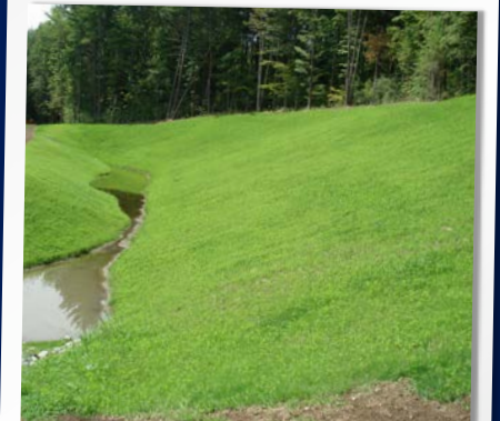
AUGUST 11, 2009